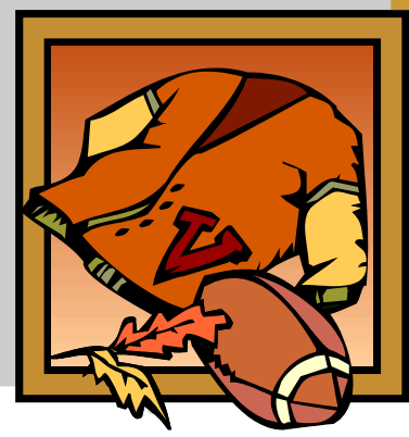
"What does Johnny's football practice and Jenny's gymnastics have to do with the Kingdom?"

This month, we are going to look at "H". Holistic approach. Having a holistic approach means that everything we do has the Kingdom in mind. Of course, you might say, "What does Johnny's football practice or Jenny's gymnastics have to do with the Kingdom?" This approach forces us as parents to realize the implications of